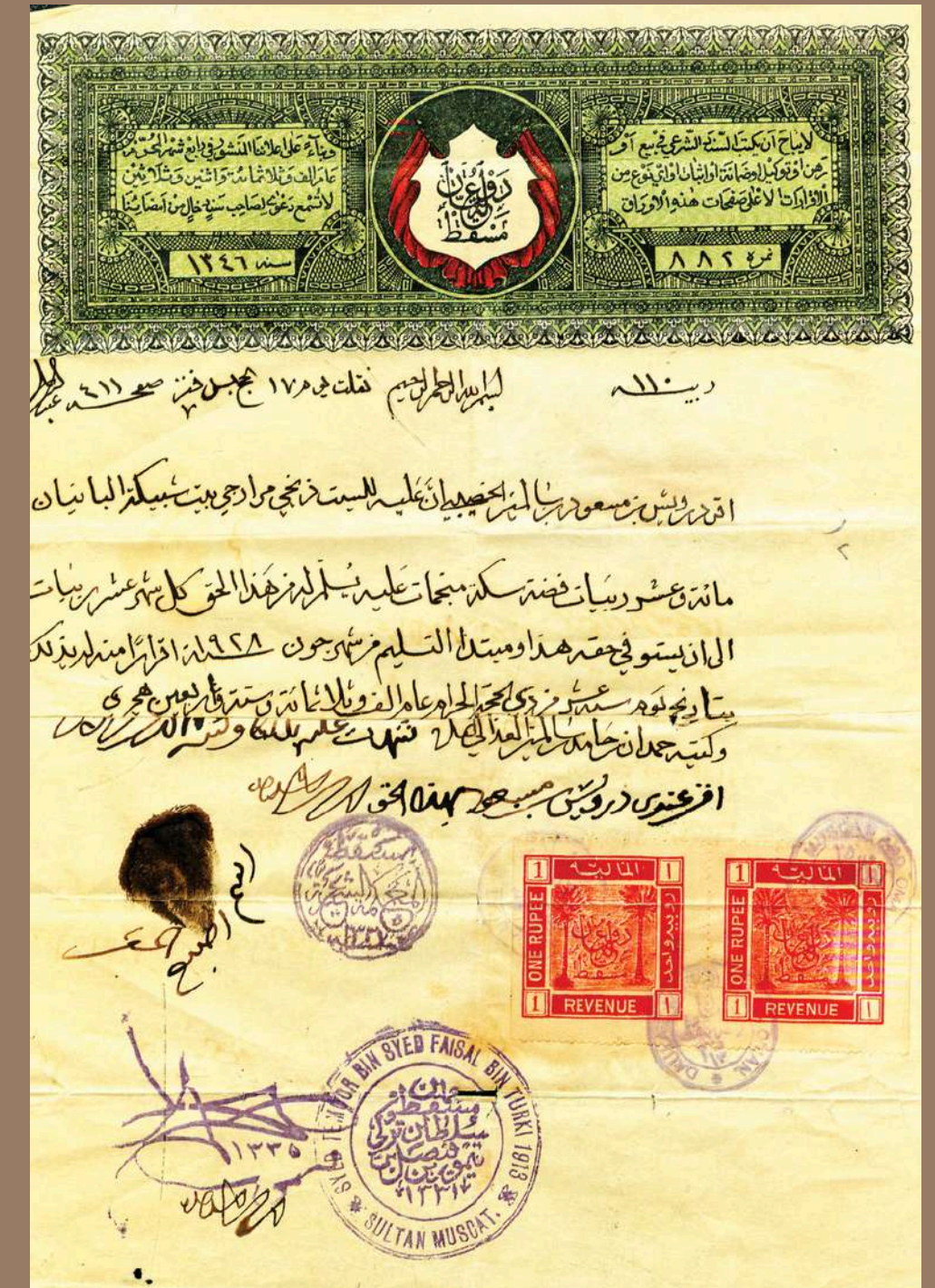
Agreement/ Contract regarding money transaction, 1914 in Arabic