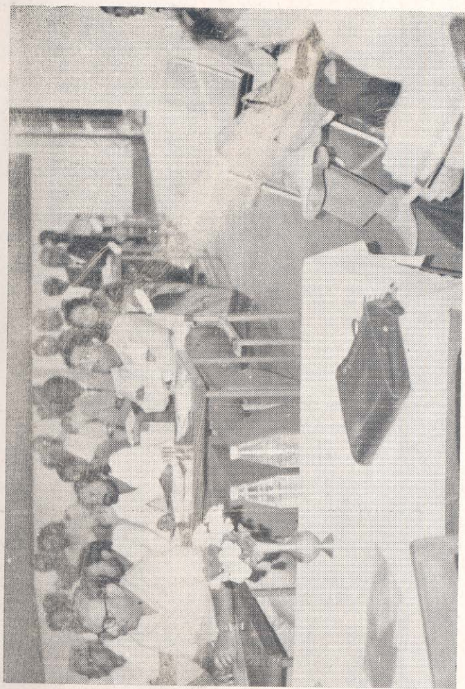
A view of the participants